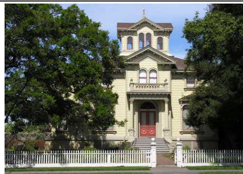
A photograph of the Pardee Home Museum in Oakland