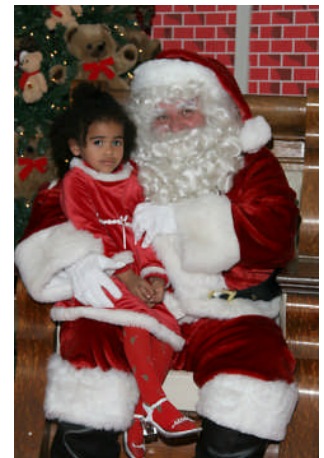
Santa greets the kids!