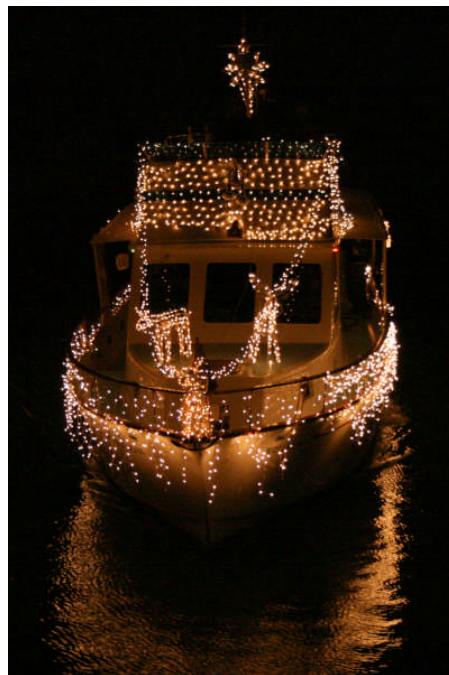
Santa comes in by boat