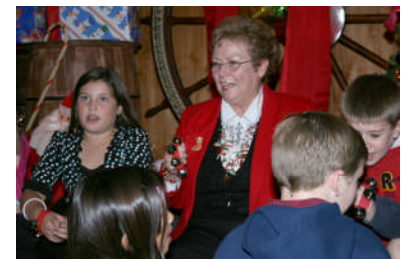
Caroling with the children