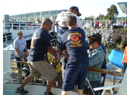
Wheel Chair Regatta —Above: A veteran is brought onboard After Midnight to enjoy a day on the Bay by the International Association of Firefighters Local 55. Below: Several veterans enjoyed a relaxing cruise on Brandywine . See the PICYA Report on Page 4 for details of Sportsmen members who participated in this rewarding day.

This is a great place to develop friendships that can plan, party, work, and cook