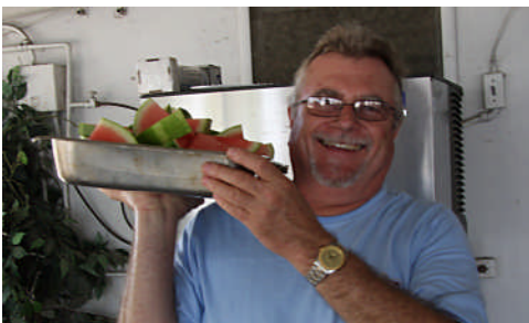
Ice cold watermelon, anyone?

Plan a trip to visit this beautiful island that is so full of history. The fall is the best weather on The Bay.