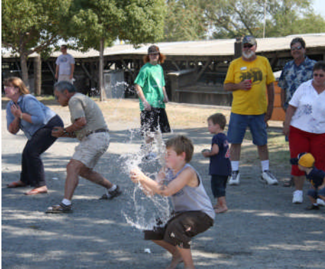
Water Balloon Toss at the Club Picnic!

The bar is doing great - thanks to everyone for helping out.