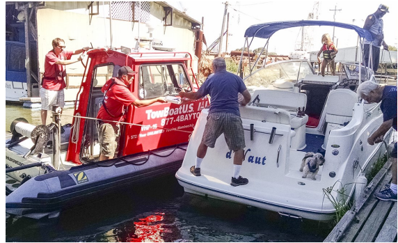
On a recent Sunday outing, Dale was reminded a little help goes a long way!

6 Club Meeting (2018 Board Nominations) 7 Work Party 13-15 Discovery Bay YC Cruise-In 13 Game Night & Dinner 14 Dinner (TBD) 15 Commodore's Breakfast 21 Breast Cancer Luncheon 28 Halloween Party