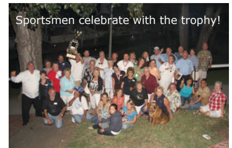
Sportsmen celebrate with the trophy!