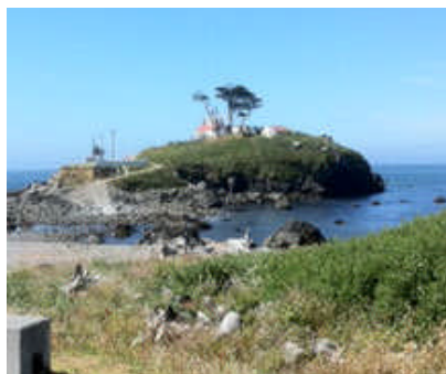
Above—A View of the Battery Point Lighthouse Island