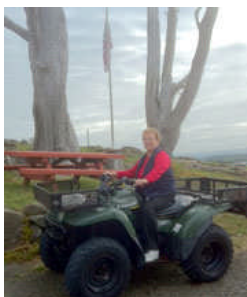
Right—Transportation around the island is by ATV