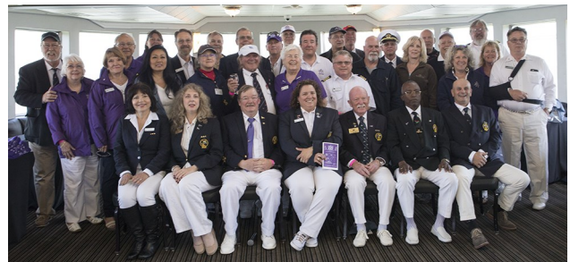
2017 Commodores from PICYA Clubs posed for a historical photo.

Let's kick start this summer in spectacular fashion! Go Sportsmen!