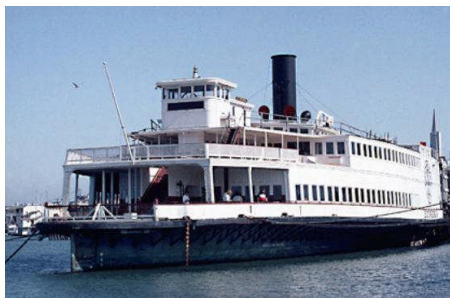
The Eureka Ferryboat a sister ferry to our beloved Sausalito Ferryboat!

The Eureka is now a floating museum just waiting for visitors. Your visit will show you how the Sausalito's engine worked so many years ago and how the cars drove on and off to get to their many destinations.