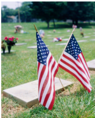
In Memory of All Who Have Served Memorial Day—May 30, 2007

I look forward to seeing you all at the Memorial Day Cruise Out Weekend!