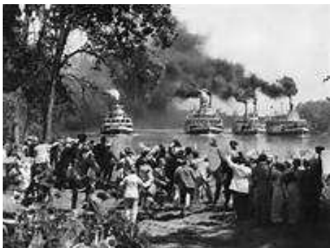
The Riverboats race in the 1935 movie "Steamboat Round the Bend," which was filmed on the Delta!

In 1935 a movie was made about the Riverboats called "Steamboat Round the Bend." In that movie four riverboats, the T.C. Walker , Fort Sutter , Cherokee Leader and the Pride of the River all were in a race at the end of the movie. It was all filmed on the Delta!