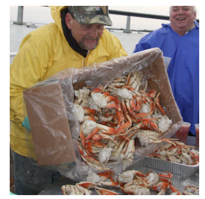
Crack some crab... Taste it to make sure it's really good... Have a Bloody Mary (Not necessarily in that order!!!)