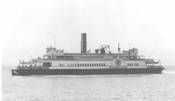
Find this, and other photos of the Sausalito, on our website!