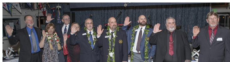
Our Officers & Directors are sworn-in