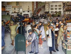
Example of one of the Fresco paintings in San Francisco.

The baths burned to the ground in 1966 and were abandoned.