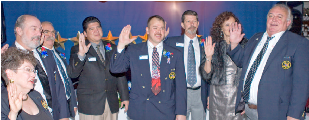
The Swearing-In Ceremony