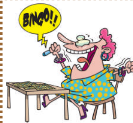
3rd Friday of the Month

We are limited to 50 reservations, so make your reservations on-line or contact Ann English at 925.779.9330